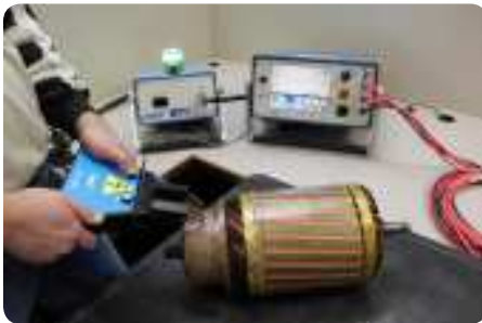
Performing armature tests is easy with the ATF5000 and Baker ZTX low-impedance component test accessories

DC motor testing is quick and accurate using the Baker DX. The tester includes an armature test mode user interface and reporting function. Interpole and field coil test results are specially labeled. Bar-to-bar and span tests can be performed on a DC armature to thoroughly analyze for shorts, opens, unbalances, weak turn-to-turn insulation, unbalances in the coils, and damaged or misconnected equalizers. For the best armature diagnostics, the Baker DX can be used with the Baker ZTX low-impedance test accessory, which enables bar-to-bar testing on most DC armatures. The Baker ZTX lowers the maximum surge test voltage and increases the available surge current for testing very low impedance coils. The Baker DX-15A features integrated ZTX technology built into the instrument.