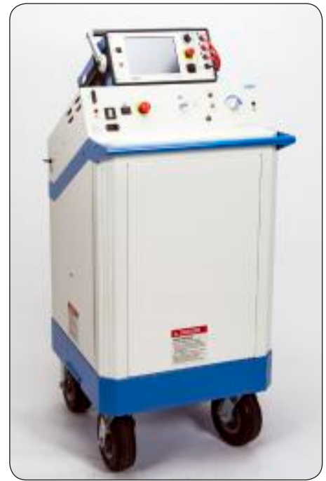
Baker DX-12 with the Baker PP40 power pack

For customers in the United States, call +1 970-282-1200; for global contacts, visit SKF's electric motor test and monitoring solutions website at www.skf.com/emcm .