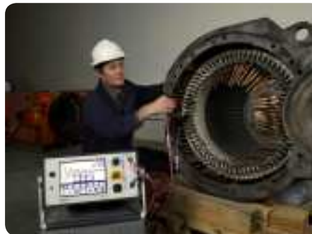
Surge testing a stator is safe with the Baker DX

The Baker DX series' range of factory configurations enables a customer to specify the tests they want. These analyzers feature: